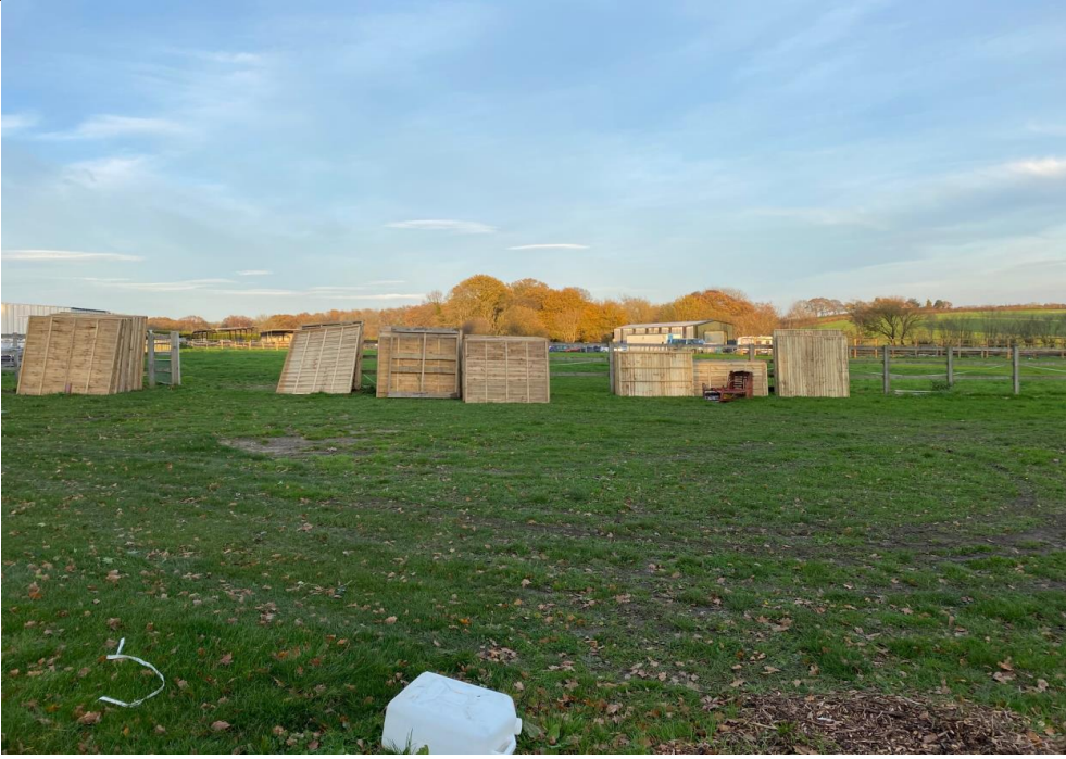
Looking toward the agricultural part of the site secured via a post and rail fence.