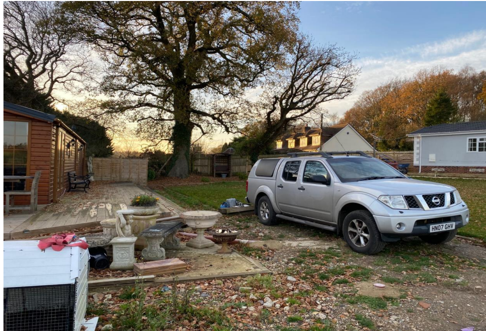
Looking west within the plot to the boundary with Pricketts Hill.