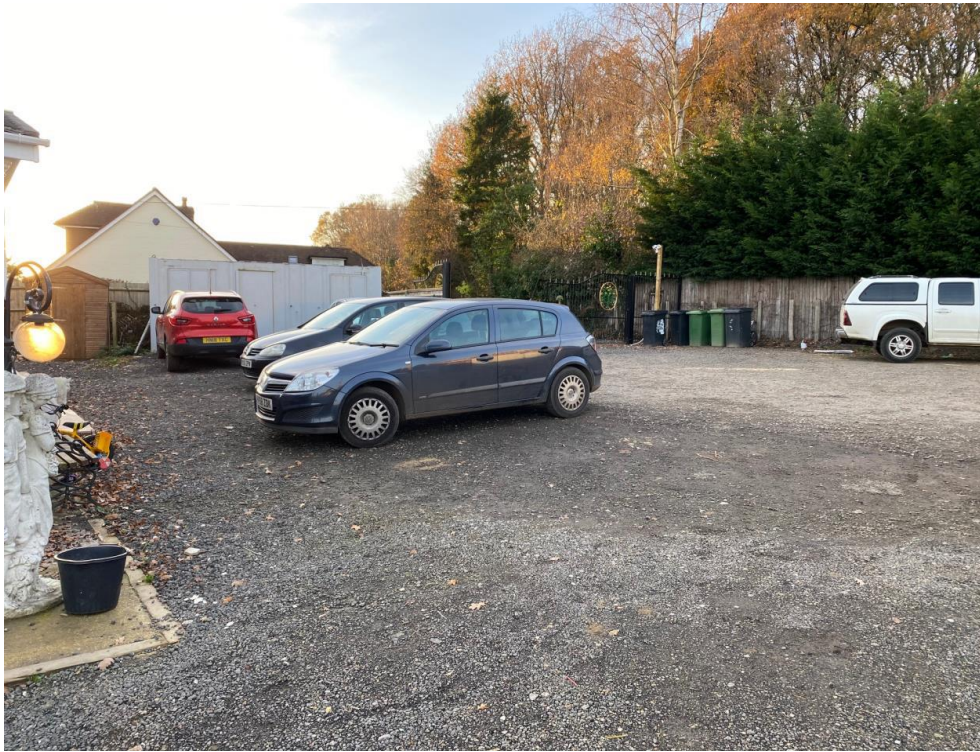
Parking area looking toward Pricketts Hill and the access